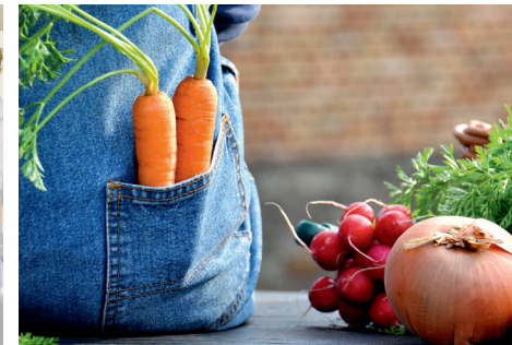
Bildnachweis: Titel: Fotolia Joe Gockel, Fotolia Photosani, DIL, Fotolia DeshaCAM, DIL, Fotolia Stefan Körber, Innen: Fotolia CNL IMAGE 360°, Fotolia iofoto, DIL, Fotolia Sema; Rückseite: Fotolia Sylwia Schreck, Fotolia angelogi